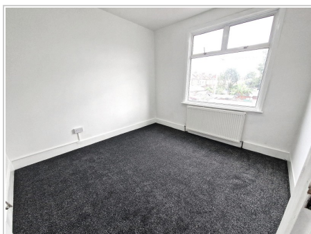
Bedroom 1 (10' 6" x 10' 3") or (3.20m x 3.12m)