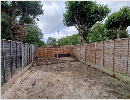
Rear Garden (26' 3" x 17' 6") or (8.00m x 5.33m)