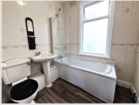
Family Bathroom Wc (6' 9" x 6' 0") or (2.05m x 1.84m)