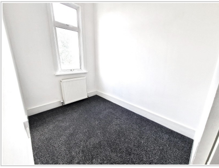
Bedroom 3 (7' 10" x 5' 7") or (2.38m x 1.70m)