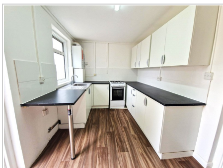
Kitchen/Diner (14' 9" x 7' 8") or (4.50m x 2.33m)

L Shape Living Room (21' 3" x 11' 1" x 16' 2") or (6.48m x 3.38m x 4.92m)