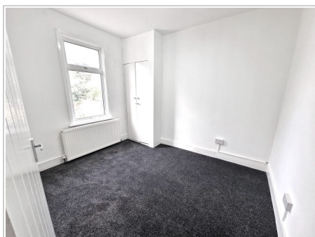
Bedroom 2 (10' 6" x 9' 0") or (3.19m x 2.74m)